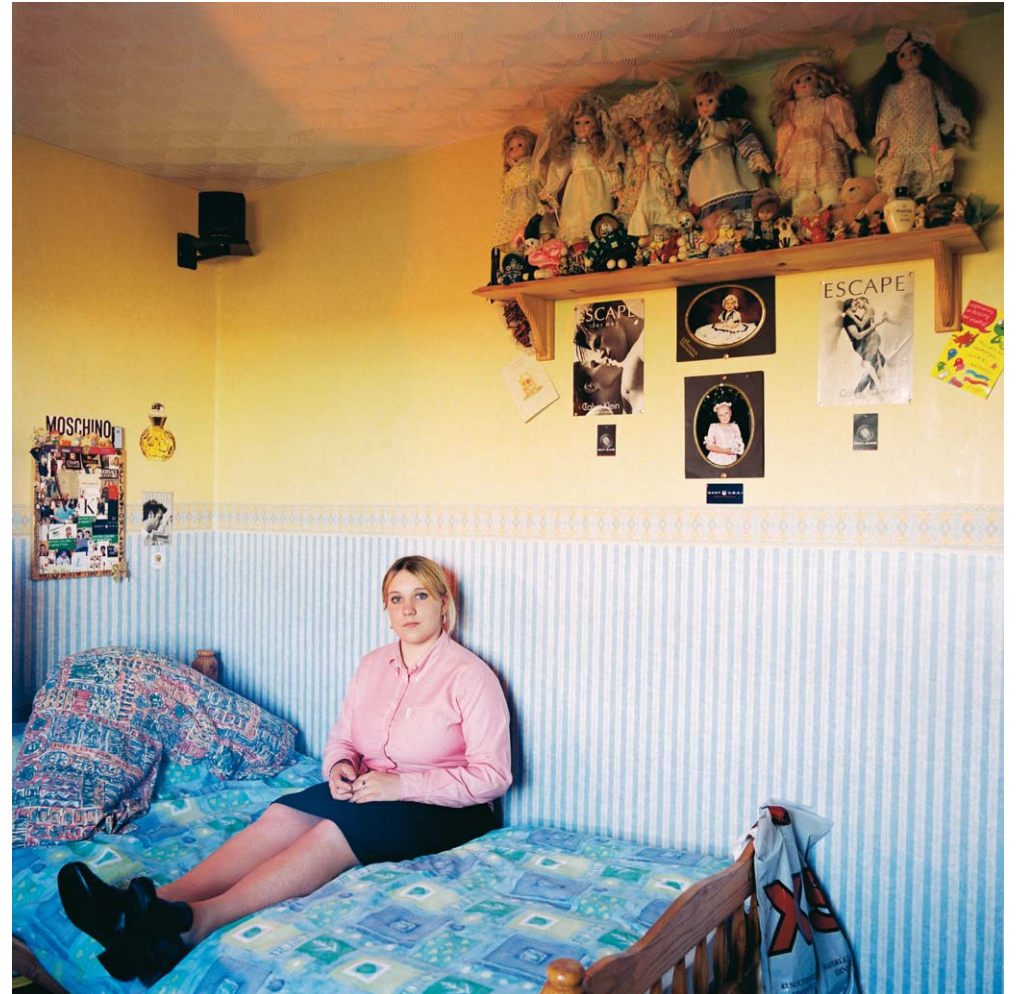
Series of photographs „The Girls' Rooms '99“ 24 colour photographs, a 60 x 60 cm